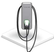
Smart EV Charger