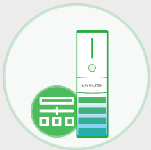
Elegant Modular and Unified Design