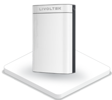
Residential Lithium Battery