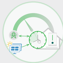
Export Control and Time-of-use Shifting